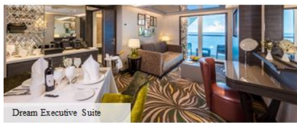
Dream Executive Suite

*數量有限-先到先得-只適用於港澳居民及 只適用於內艙房至豪華露台客房(ISS-BDA)